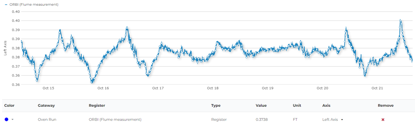
Figure 2. Flow Depth at H-Flume Example

The flow depth at the 1.5-foot H-Flume can be displayed when the ORBI (Flume Measurement) register is selected as shown in Figure 2. An example approximate depth of 0.38' is recorded which indicates a flow of 114 gallons per minute (gpm). The daily variability is attributed to diurnal temperature differences that affect the sensing equipment and appear to be muted when it is overcast or precipitating. Per the note on As-Built Sheet 1 in Appendix 3 the average design flow is 158 gpm while the maximum design flow is 367 gpm.