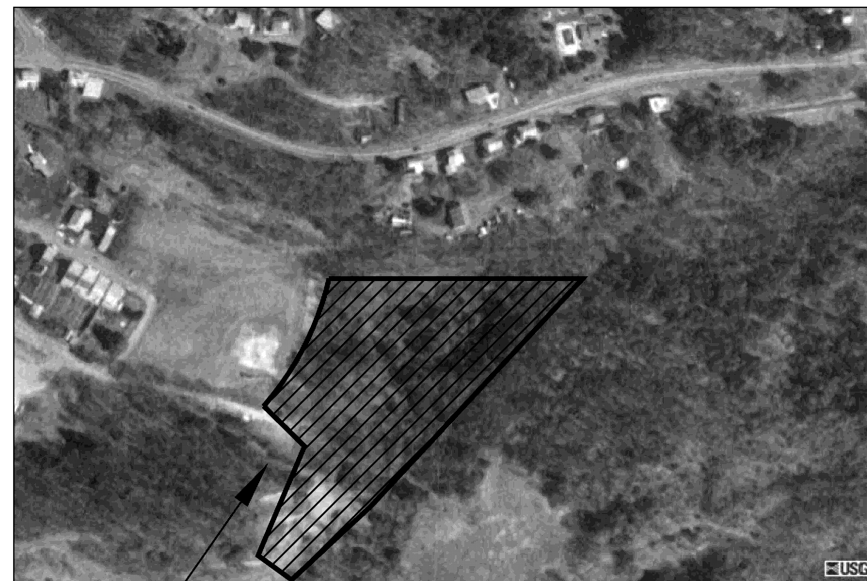
SITE MAP APPROXIMATE SCALE: 1"=150'